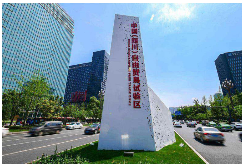
China (Sichuan) Pilot Free Trade Zone

(Translator: Chen Youbin; Editor: Jia Fengrong)