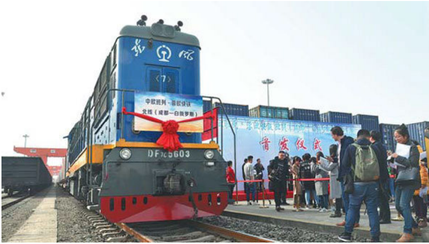
Chengdu–Europe Express Railway

Ecological Sci-Tech Park, China-France (Chengdu) Eco-Industrial Park, China-Germany Industrial Park for Medium and Small Enterprises, China-Germany Emergency Response Industrial Park, and ASEAN International Industrial Park). The Chengdu-Europe Express Railway has realized its destinations to Moscow in the north, to Lodz, Poland in the middle, and Istanbul in the south Europe. 2017 marked a breakthrough of over 1,000 trips/year, realizing the operational efficiency of 3 trips per day on average. Meanwhile, the first comprehensive services platform for cooperation with Europe, the “China-Europe Center,” has been officially launched. Sichuan has been the frontier for China to open to the outside world, and the most attractive place in western China for investment. It is this solid foundation that equips Sichuan with the endowment to be integrated into the Belt and Road Initiative.