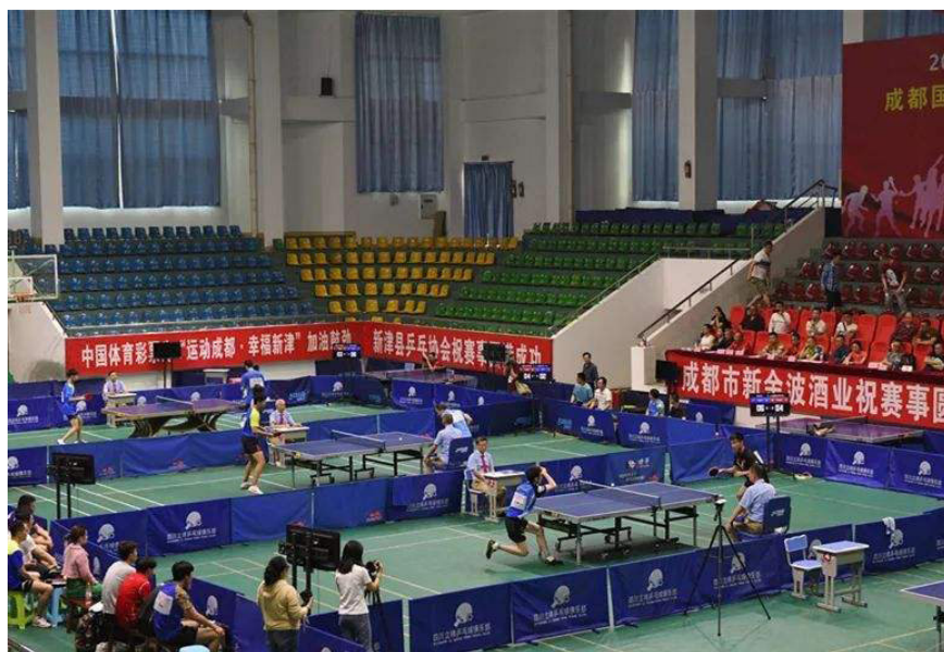
The First Belt and Road International Ping-pong Open Tournament in Chengdu

Fifth, a link to cooperation. Last year, the first Belt and Road International Ping-pong Open Tournament was successfully held in Chengdu which attracted more than 200 athletes from the countries and regions along the Belt and Road. Today, we gather here in Chengdu with our friends, both old and new, to compete and meet friends, inheriting the Silk Road spirit, and composing a splendid chapter of the Belt and Road Initiative. The Belt and Road Initiative provides wonderful opportunities and practical schemes for the global and regional economies. In 2017, Chinese enterprises built economic and trade cooperation zones in more than 20 countries, creating 1.1